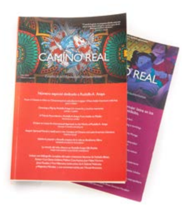
Camino Real Estudios de las Hispanidades Norteamericanas

Camino Real. Estudios de las Hispanidades Norteamericanas is a double blind-peer reviewed academic journal published by Instituto Franklin-UAH.